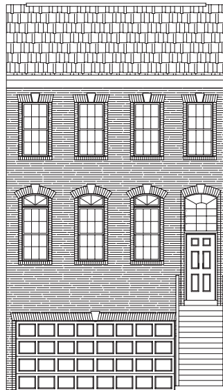
FRONT ELEVATION #3