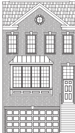
FRONT ELEVATION #4